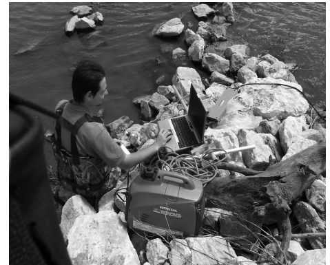
Monitoring of bridge infrastructure.

A remote but cost-effective means of monitoring scour is highly desired by DOTs across the country, because it will provide real-time condition assessment that can be used in decision making for downtime, repair costs, and estimating the remaining useful life of critically scoured bridge structures—translating to an inexpensive, automated bridge monitoring system with potential applications for other critical infrastructure, such as dams, levees, or other near-shore structures.