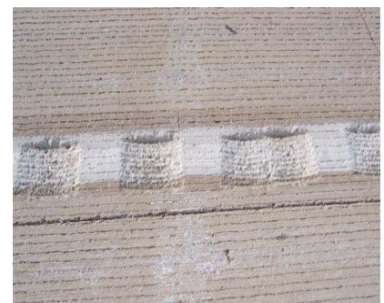
Similar wear for edge line in rumble stripe and flat section