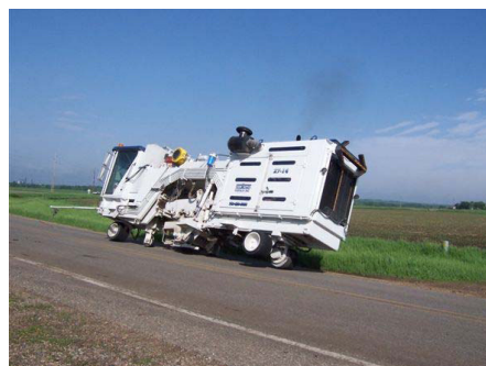
Milling machine tipping on low side of elevated horizontal curve