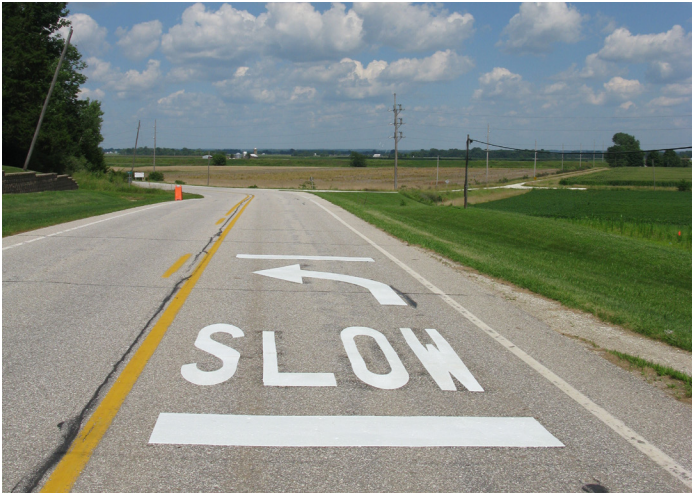
Figure 2. On-pavement curve signing along CR 99 in Des Moines County, Iowa (Hallmark et al. 2012)

Results of speed analyses are shown in Table 1. As noted, the mean speeds were reduced by 0.7 to 1.8 mph at 1 month after installation and 0.6 to 1.5 at 12 months after.