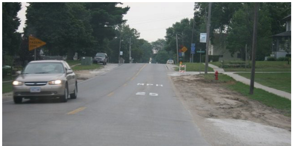
Figure 1. On-pavement speed limit signing along E-18 in Roland, Iowa (Hallmark et al. 2007)

One treatment was applied to a site along County Road (CR) 99 in Des Moines County, Iowa, which has an average daily volume of 780 vehicles per day (vpd) and a tangent speed of 55 miles per hour (mph) with no advisory speed. The second site was along L-20 in Harrison County, Iowa, and has a daily volume of 1,880 vpd with a tangent speed of 55 mph and an advisory speed of 35 mph.