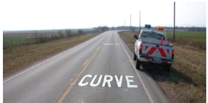
Figure 3. On-pavement curve markings (Chrysler and Schrock 2005)

The researchers collected before and after data on both a test site and a control site. The researchers used 8-ft white letters spelling SLOW at the test site, along with two white lines perpendicular to the flow of traffic and a left curving arrow (see Figure 4).