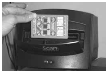
Electronic Game Cards are scanned by opening the door on the SciScan 1500.

Please refer to the validation instructions given in the Sept. 27 issue of “Lottery Action.”