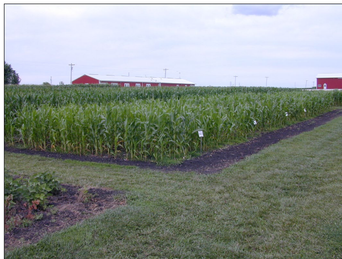
In the foreground is corn grown without synthetic nitrogen fertilizer; the research plots in the background received N fertilizer at the optimum rate.

"Cover crops are particularly promising," says Castellano, "because the Iowa Nutrient Reduction Strategy has identified those as a big tool to reduce nitrate loads. So if they also can increase or neutralize the loss of organic matter in a corn-soybean system, there are two factors that really can contribute to long-term sustainability of Iowa's farmlands."