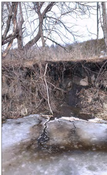
taken in Boone County, early March.

On a larger scale throughout the Midwest, we have been investigating a similar effect. We have found that for both corn and soybean, average county yields increase with the quality of the soil. We've also noted an increased chance of crop failure in poorer soils. As an outcome of our field-scale studies, we have observed two responses. First, crop yields vary across fields because of soil water availability during the grain-filling period of growth. Second, total soil water use by both corn and soybean was nearly twice as large in good soils, compared to poor soils. Since crop yield is dependent upon the amount of water used by the crop,