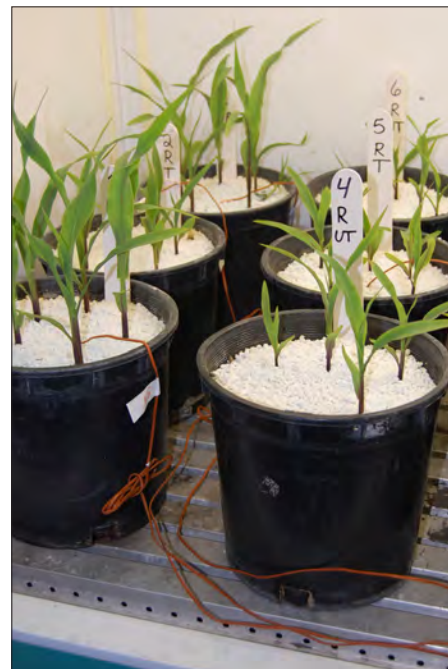
Corn seedlings grow in climate-controlled chambers in pots that previously held winter rye.

On the Ground video: www.leopold.iastate.edu/news/on-the-ground