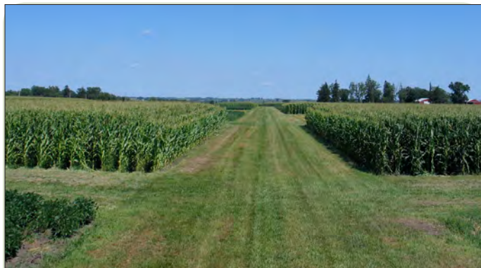
The LTAR experimental plots near Greenfield, Iowa.