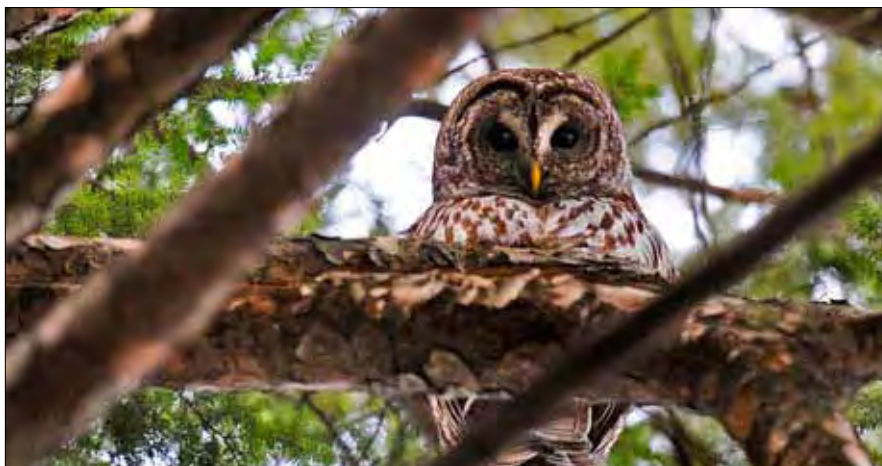
This barred owl has taken a watchful stance in the Eastern hemlocks outside the Leopold Center's second-story offices in Curtiss Hall. ISU biologists say this resident's loud hoots are associated with courtship and nesting. Aldo Leopold appreciated hawks and owls as part of "the land mechanism."

The Leopold Center for Sustainable Agriculture can best help all Iowa farmers by laying a foundation for resilience in the face of future change. Research and extension on alternative crops, new farming and food systems, and new technologies can help our state protect its precious natural resource – sustainability – and prepare for the unpredictable – resilience.