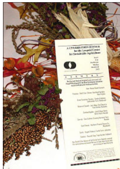
Read what Kirschenmann shared about the future of the Leopold Center during the Oct. 21, 2002 celebration dinner, on the web: www.leopold.iastate.edu/celebration_page/celebration.html