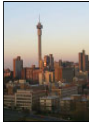
A city of contrasts: Makeshift quarters for a goat herd in Soweto outside Johannesburg; the downtown skyline.

The Summit was a logistical challenge with some 40,000 delegates and others descending upon Johannesburg. There were three official venues for meetings, conferences and exhibits and more than 500 related events throughout the city and country. Considering that Johannesburg is one of the largest cities in the world, getting from site to site was an ordeal!