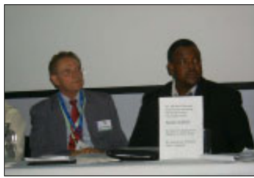
Above: The use of GMOs and who controls the intellectual property rights were hotly contested both during the World Summit and activities that preceded the official meeting.