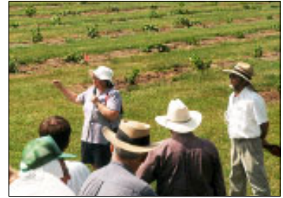
Research continues on grapes, other grant projects 4