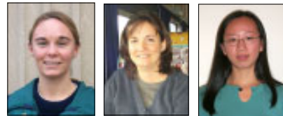
Meet our Leopold Scholars 8