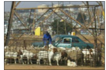
World Summit insights 6