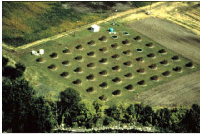
An aerial view of the Ames mesocosm research facility.

"The mesocosm facility still is one of the best wetlands research sites around," said Crumpton, whose work continues under a variety of sponsors. "It was a good investment just about any way you want to look at it. The facility made us competitive so that we could be considered for other major sources of funds, but more importantly, Leopold Center funds were the seed money that led to important new lines of research."