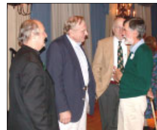
Supporters help celebrate Leopold Center work 10