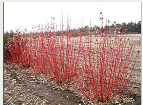
Above left, conservation professionals survey a Loess Hills landscape that incorporates trees into the system. Above right, bushes help control erosion from wind and water.

Watch four videos about the Leopold Center-supported alternative landscape biomass research team: www.leopold.iastate.edu/research/eco_files/biomass.html