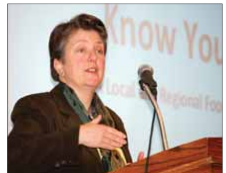
“Every family needs a farmer” – USDA Deputy Secretary Kathleen Merrigan. Listen to her speech at ISU at: www.leopold.iastate.edu/news/pastevents/merrigan/merrigan.html

A democratic approach to address food and farming challenges is a much better pathway than the acrimony that now seems to accompany food politics.