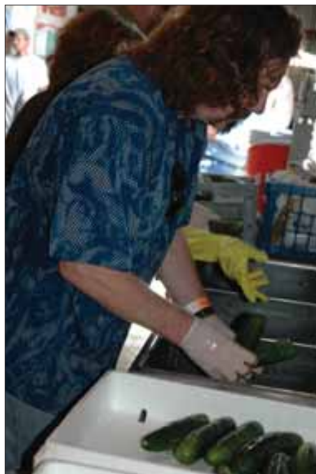
Photo gallery, tips from Blanchard: www.leopold.iastate.edu/gallery/FVWG_slideshow/index.html

Post-Harvest Handling Decision Tool: www.valuechains.org/fruitvegetable/postharvest.htm