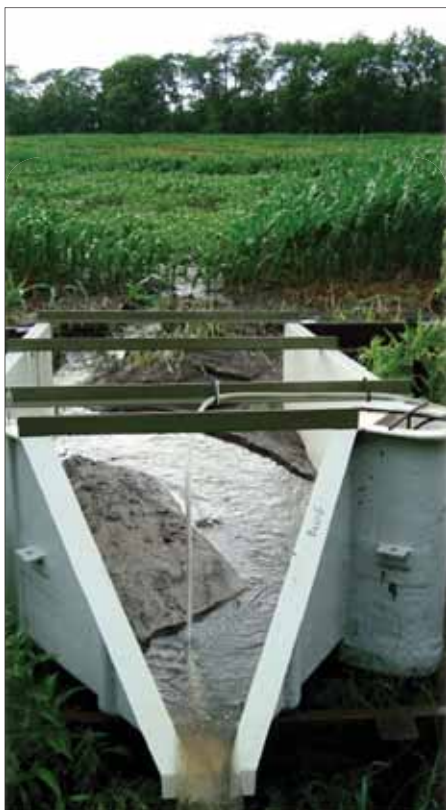
This flume collects field runoff from research plots at the Neal Smith National Wildlife Refuge.