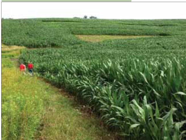
Prairie strips are placed in strategic locations within each watershed.