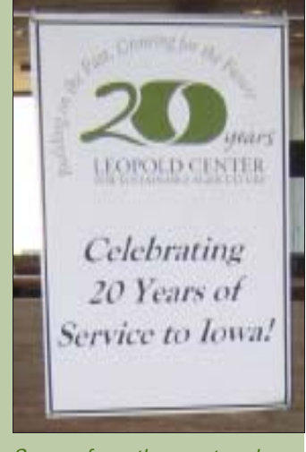
Scenes from the courtyard, conference atrium