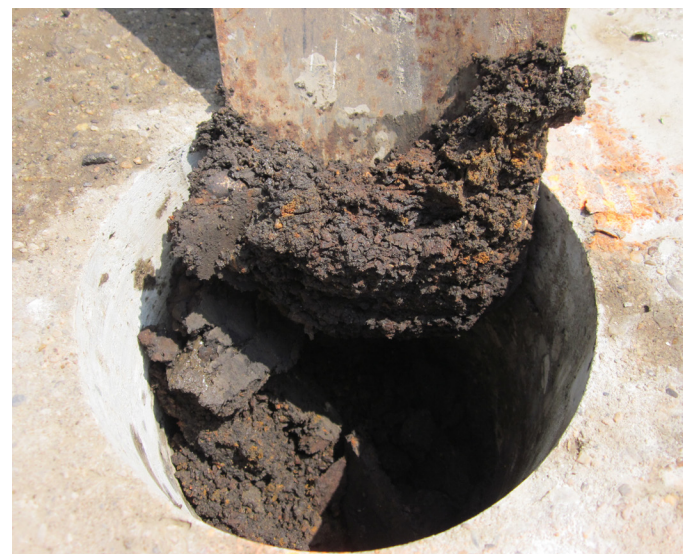
Figure 4. Excavation of subgrade soil

Previous research indicated that uniformity of pavement support conditions plays a critical role in long-term performance of PCC pavements. Uniformity of pavement support conditions was also evaluated in this study based on FWD test results. A uniformity classification matrix was developed to compare results from each site.