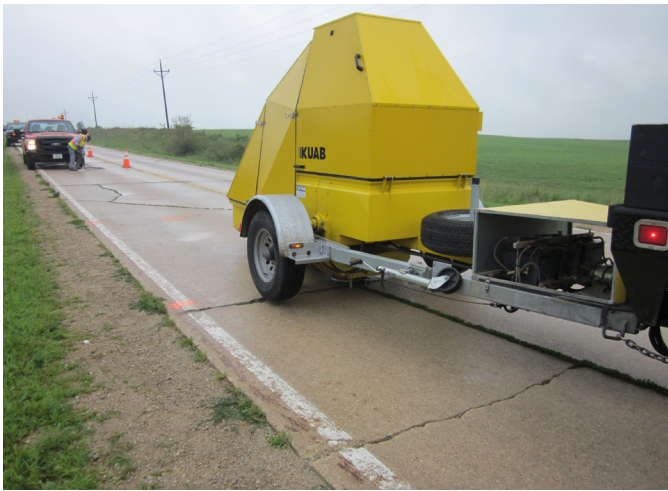
Figure 1. Falling weight deflectometer testing