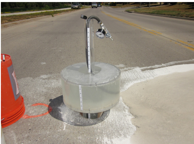
Figure 3. Core hole permeameter testing

permeameter (CHP) test device (Figure 3). FWD tests provided a measure of subgrade k values (hereafter, referred to as k_{\text{FWD}} ). The k_{\text{FWD}} values determined from this study were corrected for slab size and dynamic effects and reported as Static k_{\text{FWD-Corr}} values. DCP tests were used to empirically estimate the modulus of subgrade and subbase layers, and then graphically determine the composite modulus of subgrade reaction k_{\text{comp}} values (hereafter, referred to as k_{\text{comp-DCP}} ), per AASHTO (1993) guidelines. k_{\text{comp}} values were also determined from Static k_{\text{FWD-Corr}} values using subbase layer modulus estimated from DCP tests and the AASHTO (1993) graphical procedure and are reported as Static k_{\text{comp-FWD-Corr}} . Loss of support under pavements was evaluated based on FWD testing using the concept of zero load intercept, and also by comparing the k_{\text{comp}} values determined from FWD and DCP tests. It is assumed that the FWD tests take into account the loss of support that is existing under pavements at the time of testing, but the DCP tests do not because only properties of individual layers are used in the calculation.