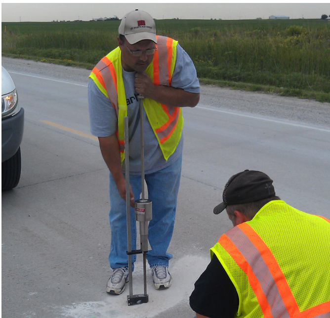
Figure 2. Dynamic cone penetrometer testing