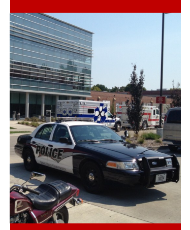
Police, fire, and ambulance respond to a call for assistance at Hach Hall.