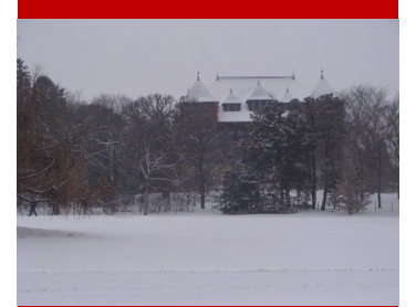
Catt Hall in the Winter