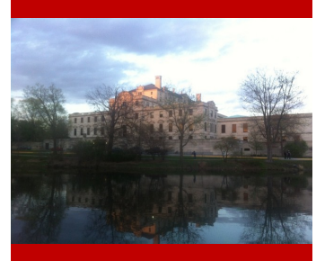
Memorial Union