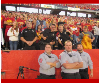
Police officers and student community service officers assist with crowd control during home football games.

Section 262.13 of the Iowa Code grants university police officers the authority to apprehend and arrest anyone involved in illegal acts on, or adjacent to, campus. Statewide jurisdiction exists when acting in the interests of ISU.