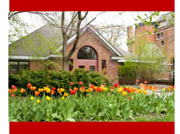
The Hub in Spring