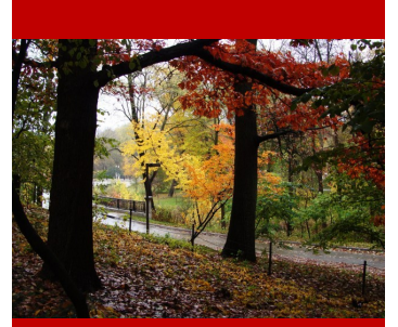
A wet fall day on campus.