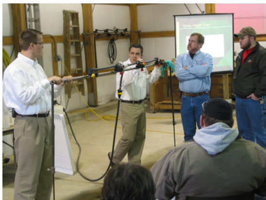
Pesticide applicator training at NECAS.

commercial pesticide applicators participated in a week-long training school which included classroom and behind-the-wheel learning opportunities. Other courses held at NECAS for agribusiness included LP safety, propane safety, and general employee safety trainings.