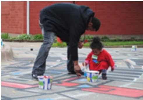
Dubuque, 2014 MSI Award winning public improvement project, 18th and Washington Intersection Mural Project