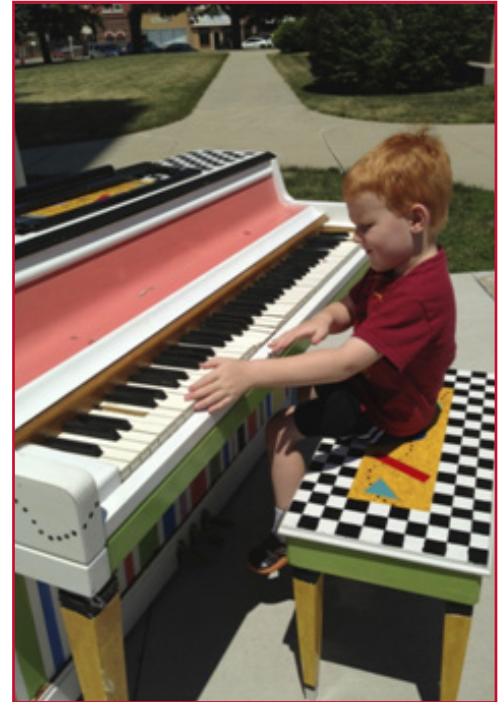
Jefferson, Play Me Pleez Winner in the Promotion Image Category