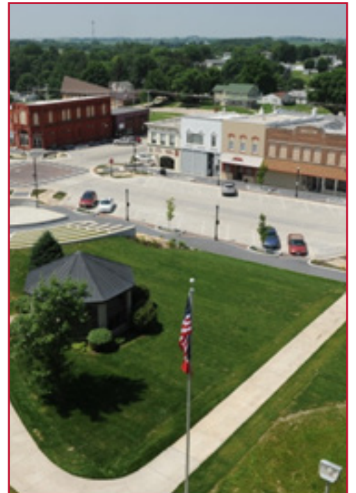
West Union, Green Pilot Streetscape Project Winner of the Signature Project of the Year

Photographs and the awards' listing are posted at http://www.iowaeconomicdevelopment.com/IDRC/MainStreetIowa .