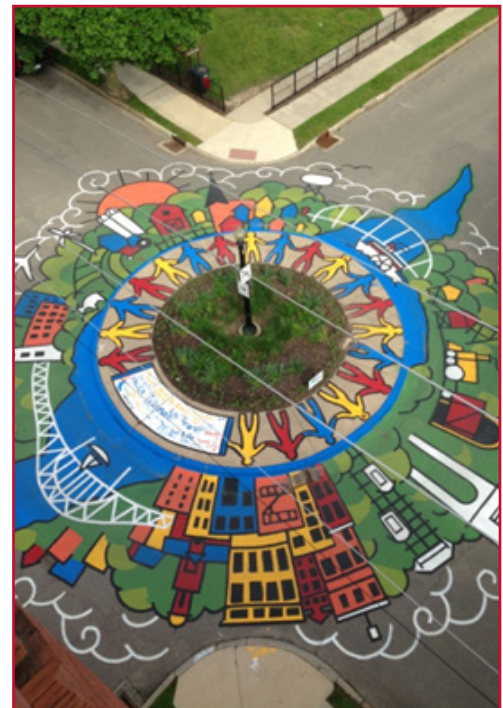
Dubuque, 18th & Washington Intersection Mural Project Winner in the Design Public Improvement Category