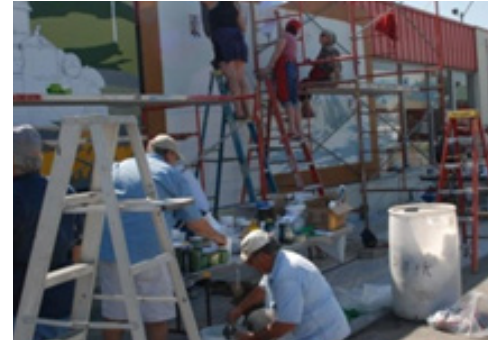
volunteers participating in the Belle Plaine mural project

Contact local entities and extend invitations to present at youth, senior citizens and special interest group meetings. This is an opportunity to explain the importance of the initiative's mission and have a dialogue with them about how they might contribute their time, talents and resources for the cause. All have a stake in the viability of the district but they do not always understand that connection unless you help "connect the dots."