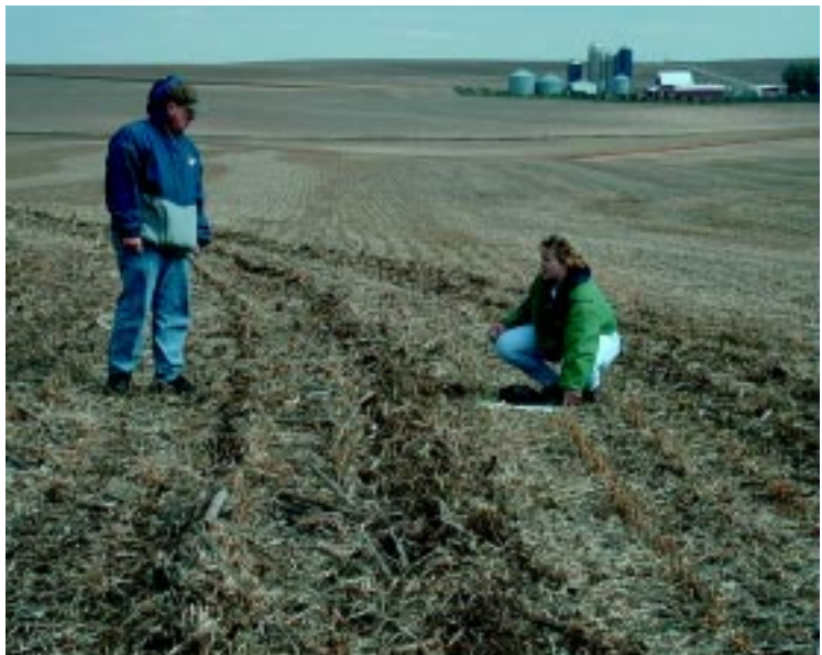
NRCS employees measure residue after manure application.

For more information about residue management, conservation compliance and