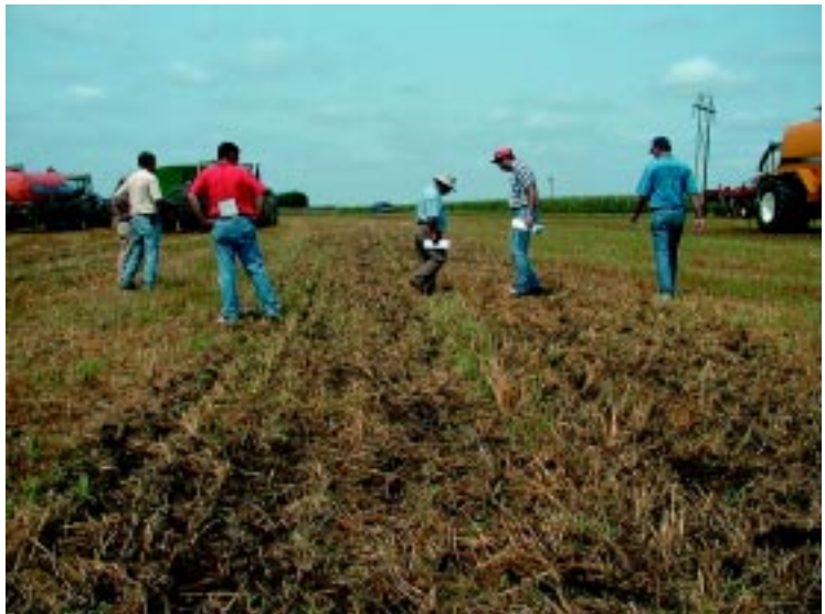
Field day attendees evaluate crop residue after manure application.

for CNMPs, please visit your local NRCS office.