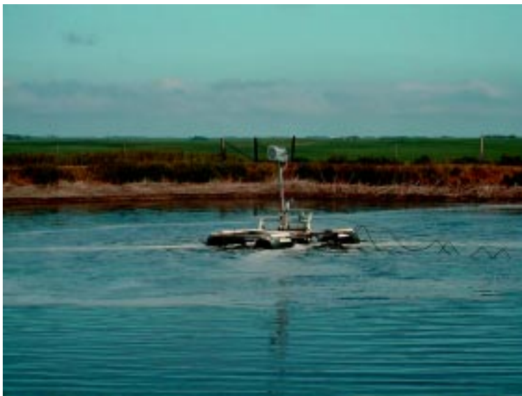
Aerator on second-stage lagoon at sow facility.

Frankel showed them some aeration systems that were successful at reducing lagoon odors, so they decided to try one. That was 4 years ago, and the Hirschmans continue to be pleased with the results. The system the Hirschmans use is providing them with good quality liquid to flush through shallow pits to help reduce odor and maintain high air quality inside and outside of the buildings.