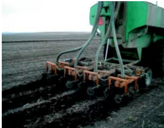
Manure application equipment.

A pplication of manure and meeting conservation compliance plans has been a controversial issue. The most common method of manure application is by injection or broadcast application followed by incorporation. Injection or incorporation is done to reduce offsite nutrient movement to waters of the state, place manure nutrients closer to the crop rooting zone, minimize odors, and provide some means of tillage. Injection or incorporation of manure can reduce residue, leaving soils bare and more vulnerable to wind and rain erosion. Fall application of manure by using these systems can leave soils bare longer, resulting in potentially greater offsite movement of soil and nutrients. So can manure application and conservation compliance live in harmony? The answer to this question is "yes."