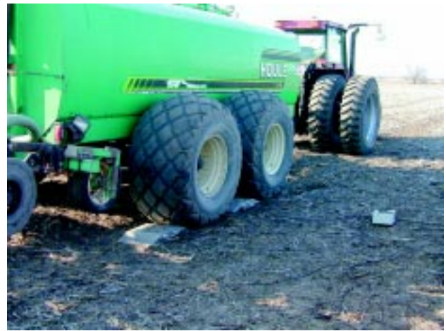
Weighing equipment to document application rates.

Using a cooperator's presample total-N analysis, targeted manure application rates are calculated. Manure is applied at zero (check), half, and full rates of total-N (target of 0, 75, and 150 lb of total-N per acre before corn in a corn-soybean rotation; 0, 100, and 200 lb of total-N per acre in continuous corn or before soybean). Field-length manure treatment strips are randomized and replicated three times at each field site. When manure is applied, portable scales are used to weigh application equipment for rate calibration. Multiple manure samples are collected during application and analyzed like the presamples to document total-N, -P, and -K nutrients applied in treatment strips. These data are