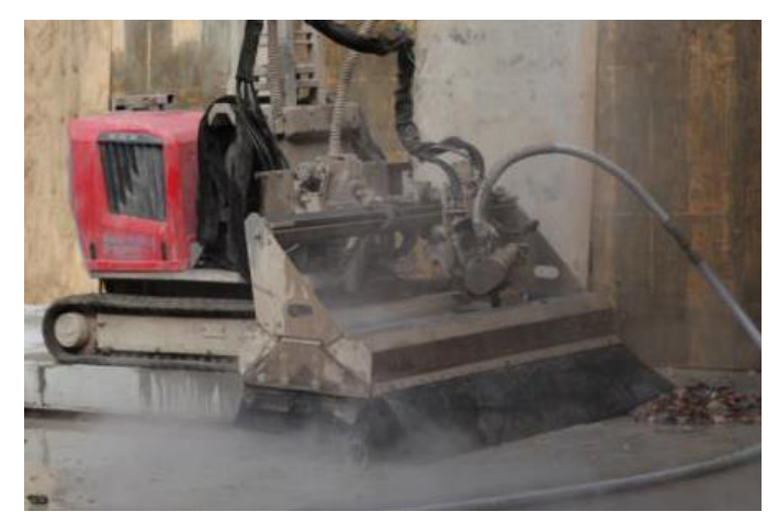
Hydrodemolition trial (Dang 2013)

Small-scale trials of three promising deck removal methods—hydrodemolition, chemical splitting, and peeling—which were identified through the surveys and workshops, were conducted to evaluate their effectiveness.