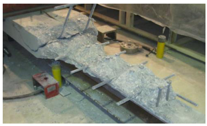
Second peeling test (2 shear studs) (Dahlberg 2014)

These methods have not been widely or often used to remove bridge decks, but were thought to have the potential to change and have a positive impact on the state-of-thepractice for bridge deck removal.