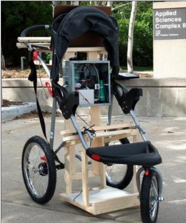
Fabricated equipment cart used for field testing

Interference from reinforcing steel is unavoidable except by placing the tags at least a few inches away from it. The detuning effect is caused by the dielectric constant of the concrete and can be resolved by encapsulating the tag in a foam that more closely approximates the dielectric constant of air.