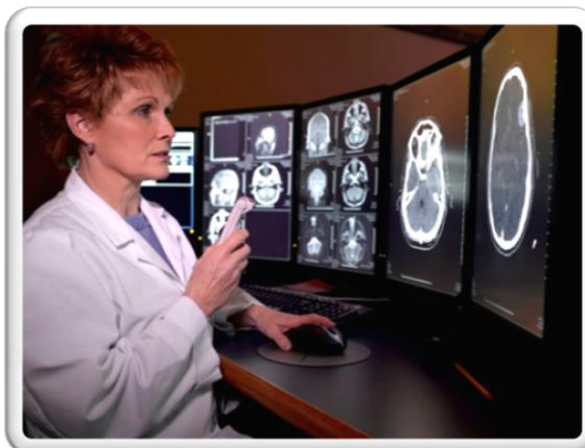
A physician dictating while viewing a radiology study.

The goal of the IRHTP consortium, led by the Iowa Hospital Association (IHA), is to deploy a secure, statewide, high-speed broadband network connecting rural hospitals to vital healthcare resources without geographic restrictions. There are currently 71 healthcare facilities connected to the IRHTP statewide fiber-optic Network as of January 31, 2012.