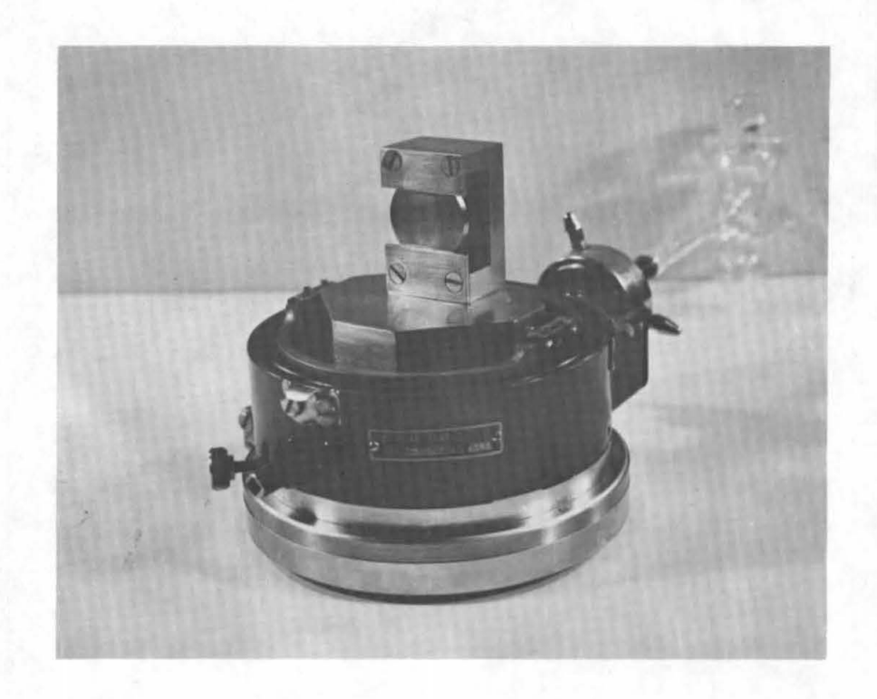
(b) Base of the X-ray adsorption apparatus showing the sample holder.

(a) X-ray adsorption apparatus, assembled.