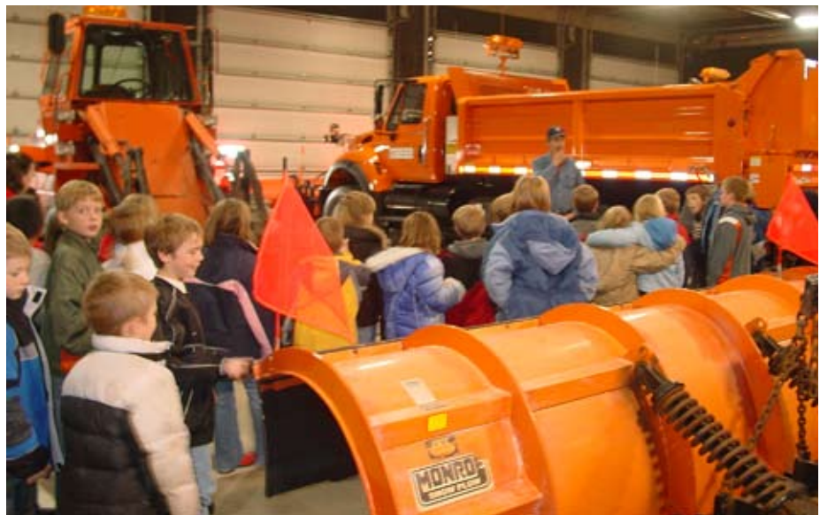
Third graders in Pocahontas were treated to a tour of the DOT facility and an up-close look at the large equipment.