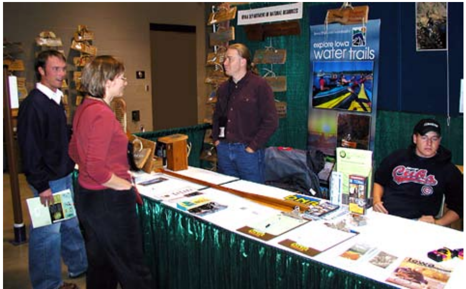
Symposium attendees were able to browse booths from sponsor organizations and learn more about trails in Iowa.

In addition to presentations and exhibits, what would a trails conference be without field trips? The outings showcased many of the best trails and