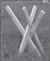
Tetrapods on U.S. 20 near Waterloo

From the old stand-by slat snowfence to the funky looking tetrapods and vortex generators, the Iowa DOT continues to work towards making winter driving on Iowa roadways safer for all motorists.