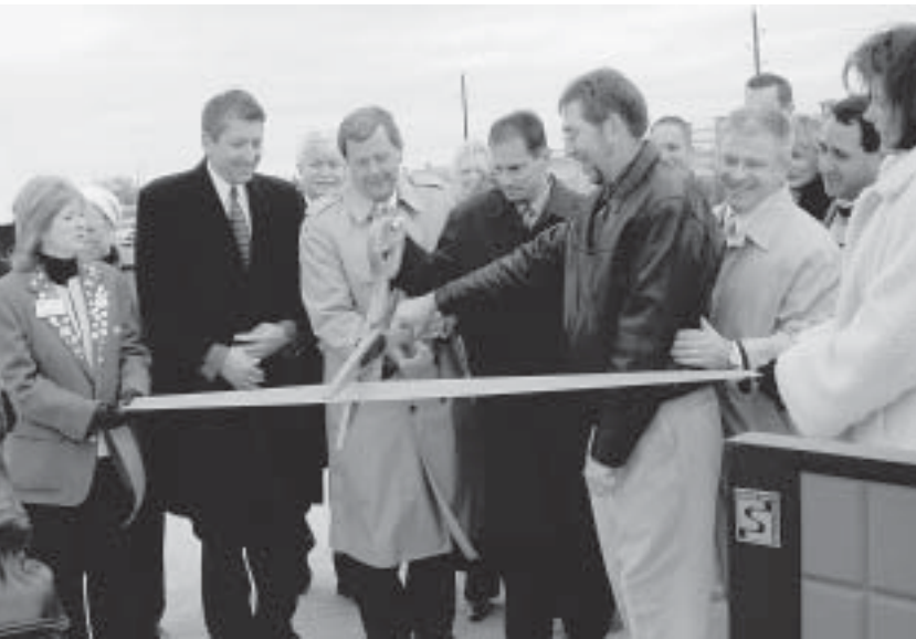
Officials cut the ribbon Nov. 14 to open the I-29 interchange leading to Sergeant Bluff and the Sioux Gateway Airport.