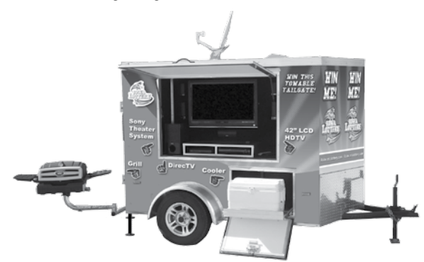
Representative of prize, not actual prize.

Enter non-winning tickets Aug. 29 - Dec. 6, 2011 for another chance to win