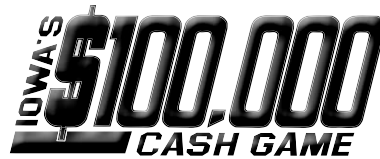
Schedule for Selling Cash Game Multi-Draw Plays

And stay tuned! We'll be updating you soon about a new lotto game that will have a top prize of $100,000 and an interesting twist on how players can win it!