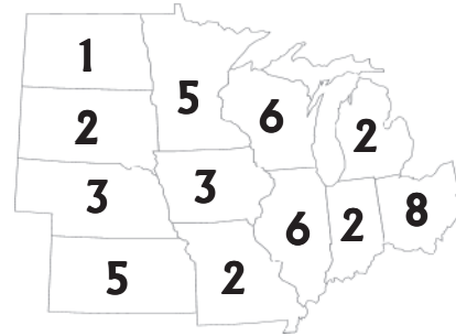
2001: Fatal Crashes between Farm Equipment and Motor Vehicles (50% of US total)**