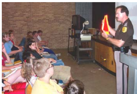
An Iowa State Patrol trooper speaks to classes about roadway hazards involving farm equipment.

The program, presented to over 180 driver education students, used an interactive driving simulator to measure reaction times and involved an Iowa State Patrol trooper