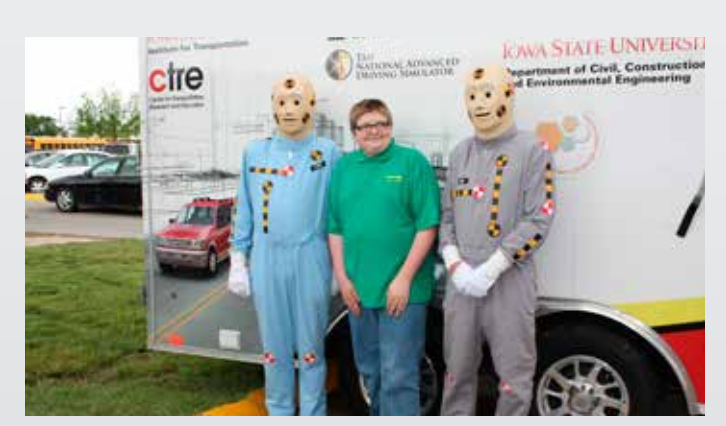
Crash test dummies Vince and Larry made an appearance at Saydel High School and posed for photos with the students.