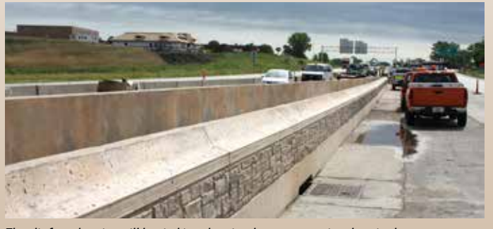
The slipform barrier will be tied into barrier that was cast-in-place in the area.