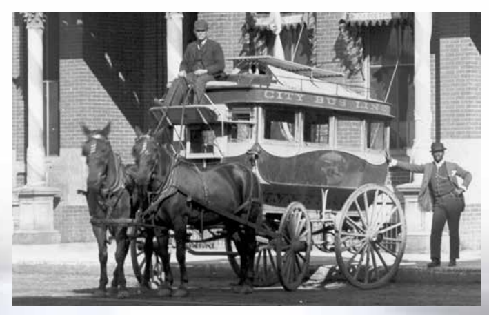
Stagecoaches were an early form of public transportation in lowa.

The railroad crossing surface program provides funding to rebuild crossing surfaces, through a cost sharing program with costs split by formula between the state, railroad and highway authority. Additionally, grade crossing surfaces on primary highways are rebuilt cooperatively with railroad and lowa DOT personnel and equipment.