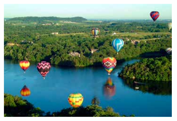
Hot air ballooning is a popular form of recreation in lowa.

On the state level, three entities guided the development of aviation in Iowa. These included the Commission on Aeronautics from 1933 to 1945, the Iowa