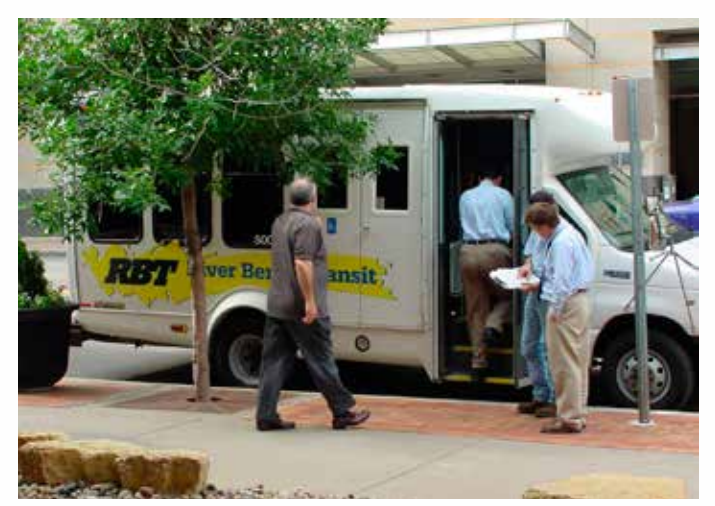
Specialized transit services provide much-needed mobility for many lowans.

Transit ridership hit a peak after World War II, as cities expanded geographically farther in subdivisions and suburbs. Through the 1950s and early 1960s, as private transit operators reduced service because of the growth in ownership of personal motor vehicles, communities acquired local bus systems and began public operations.