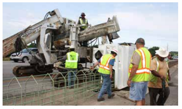
For this innovative project, concrete is poured into a specialized slipform.

"The cost savings using this process were tremendous. Even though we had not used this yet in lowa, several other states have had success, so we were confident it would be successful here, too."