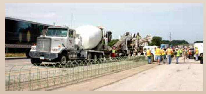
Eight miles of barrier rail were installed in the lowa City/Coralville area using the slipform paving technique.

When the bid for the work was let, the cost estimates for slipform paving the 8 miles of barrier rail were 33 percent below that of cast-in-place, textured barrier rail. Olson said,