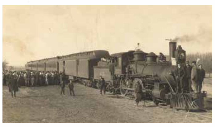
Dairy Train, 1913

Predating the organized planning of highways, the lowa Railroad Commission was the governing body of all things rail from 1878 to 1937, when the commission was folded into the lowa Highway Commission. The Railroad Transportation Division was located in Des Moines and moved to Ames in the early 1980s.