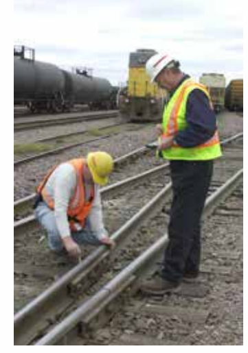
lowa DOT track inspectors work with the railroads to ensure safety.

The Office of Rail Transportation strives to maintain a safe rail system, encourage economic development, and support and strengthen lowa's rail transportation system. The office administers several programs to accomplish these goals using a combination of state and federal funds.