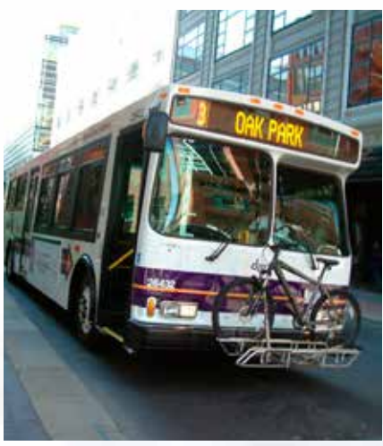
Modern public transit provides service to all 99 lowa counties.

The lowa DOT advocated the establishment of multi-county regional transit systems in the late 1970s, which provide services in every corner of the state. Today, residents of all 99 lowa counties can access public transit through 16 regional