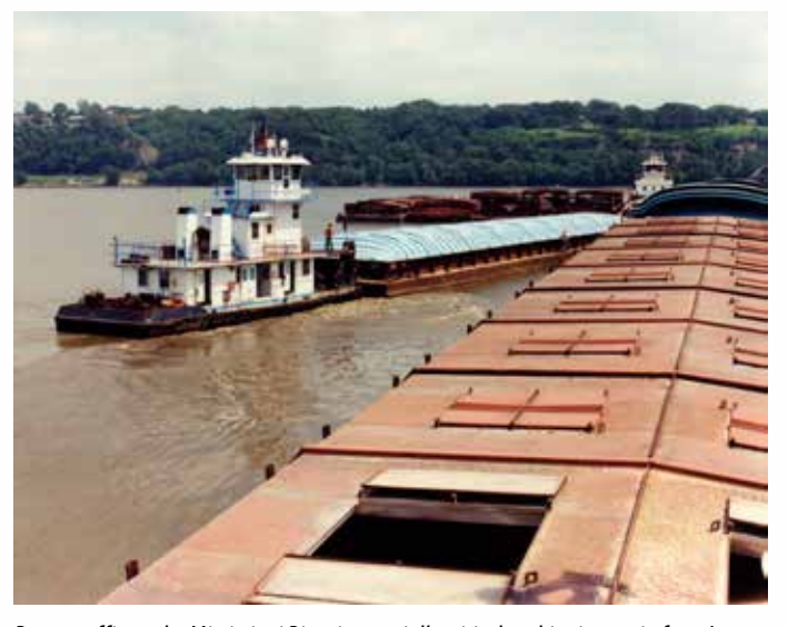
Barge traffic on the Mississippi River is especially critical to shipping grain from lowa.

In the mid-1980s the responsibilities for water transportation were brought to the Railroad Transportation Division and it became the Rail and Water Division. The division was in charge of overseeing the regulation of the railroads operating in lowa, including hearing disputes over