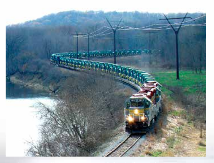
Freight rail is a vital link in the movement of all kinds of commodities in lowa and beyond.

abandonments, fences, blocked or private crossings, eminent domain, etc. As a result of a 1995 agency reorganization, the signal, surface and track inspection programs were transferred to the Maintenance Division. Rail regulation and assistance programs were assigned to the Office of Planning Services. The rail/highway construction segment moved to Office of Development Support. Responsibilities related to lowa's navigable rivers were transferred to the Office of Policy and Legislative Services, and later to the Office of Systems Planning.