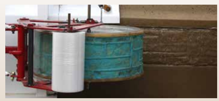
The decorative imprint is pressed in using a roller with plastic sheeting to keep the concrete from sticking. The plastic is later removed.

So the next time you're on I-80 in the lowa City/Coralville area, pay attention to the details between the lanes of traffic. Not only do they look great, they are safe, met the needs of our customer, and saved money in the process.