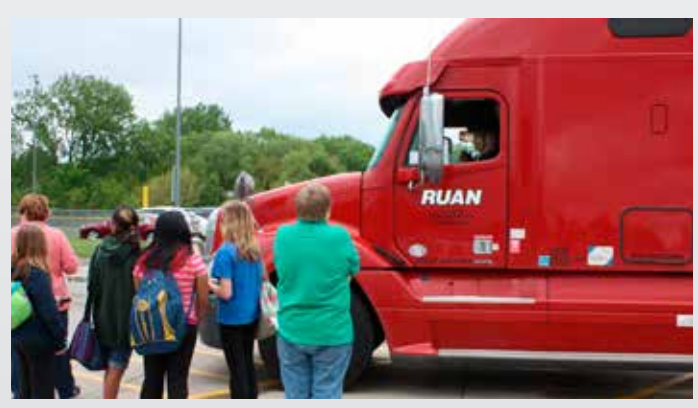
Saydel High School students got the chance to sit inside the cab of this semi to witness the "No Zone" first hand.