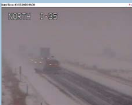
Images from the RWIS cameras can show supervisors the road condition instantly.

modem, the number of images is fewer because of the long download time for each image. Just like at home, you can have slower dial-up versus faster satellite Internet access. Upgrades to the communications will be done as local phone companies upgrade their systems."