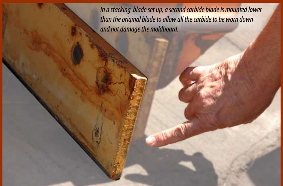
In a stacking-blade set up, a second carbide blade is mounted lower than the original blade to allow all the carbide to be worn down and not damage the moldboard.

Steinhart says the standard carbide setup makes it very difficult to use up the entire carbide insert without damaging the moldboard. "It can get really expensive if you have to repair the main plow's frame mounting holes," said Steinhart. "So operators were very careful not to let the blades wear too far down, which wasted some of the carbide. Using the stacking process, the entire carbide insert can be used on the first blade without damaging the moldboard."