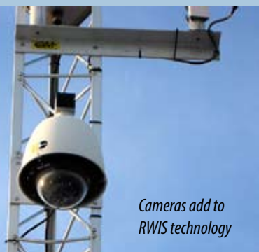
Cameras add to RWIS technology

Because the communications bandwidth varies by site, there are from three to eight images available from each site's camera. "Sites with higher bandwidth capabilities can support downloading more images," said Greenfield. "When a site's only communications access is a radio or phone