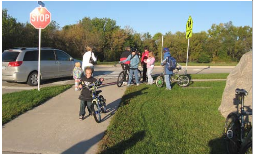
Kids in North Liberty walked and biked to school Oct. 7 for International Walk to School Day

The program is geared toward increasing children's activity levels. Childhood obesity has been on the rise and, according to a Centers for Disease Control and Prevention report, far fewer students walk or bike to school than used to. In 1969, roughly half of all children walked or biked to school, now it is only about 15 percent.