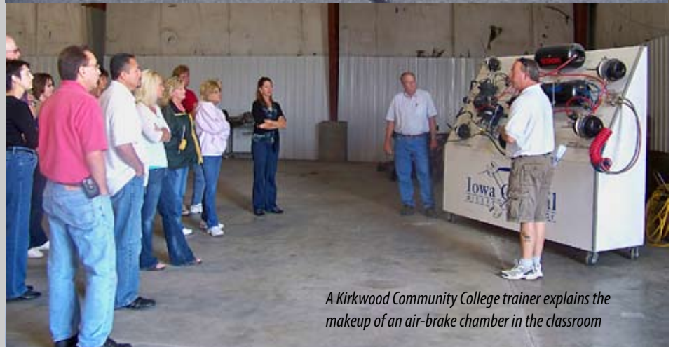
A Kirkwood Community College trainer explains the makeup of an air-brake chamber in the classroom