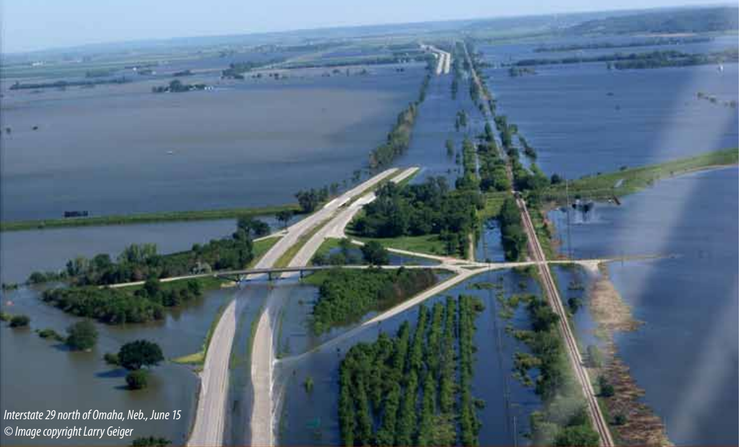
Interstate 29 north of Omaha, Neb., June 15