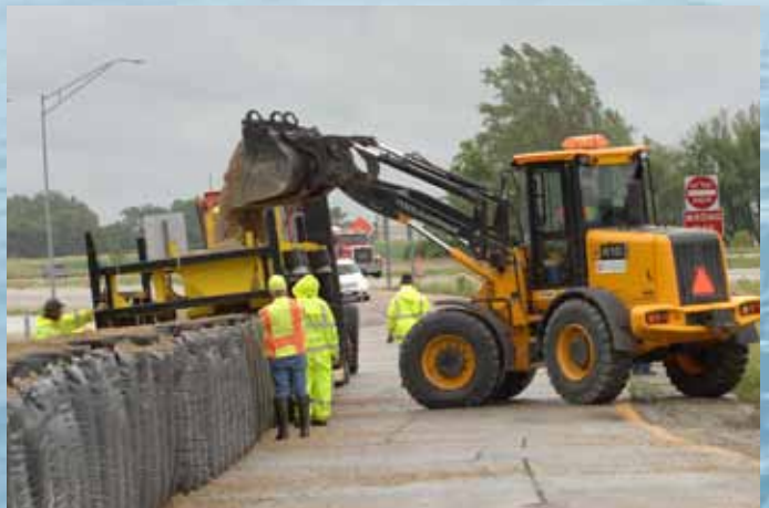
Iowa DOT flood mitigation efforts along I-29 near Blencoe attempt to keep the river off the roadway.