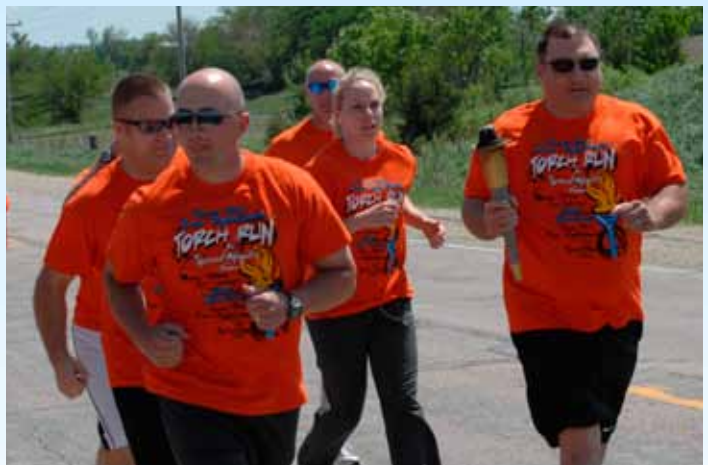
Iowa DOT motor vehicle officers run the torch from Elkhart to Huxley.