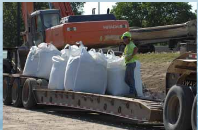
Hauling giant sandbags to U.S. 77 and Wesley Parkway in Sioux City

Thank you to all Iowa DOT employees who have assisted in the flood efforts. While the geographic range of the impacted area is relatively small, the impact is being felt around the country.