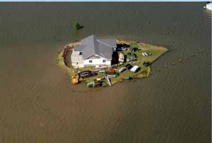
A rural homeowner took every measure possible to save home and property.