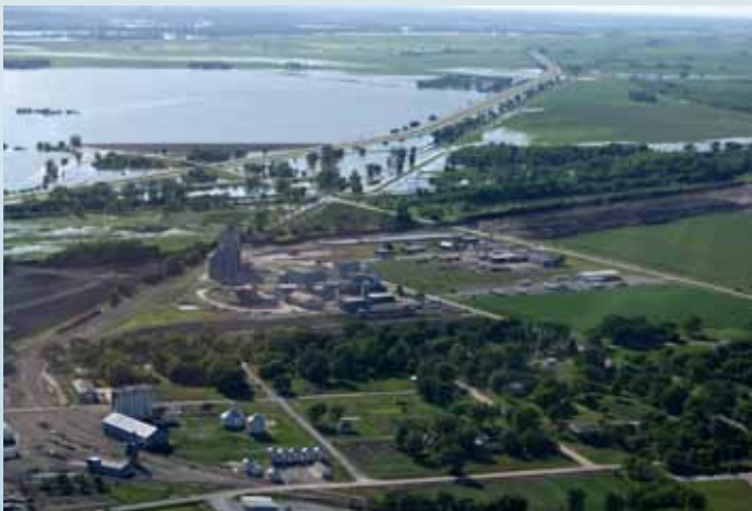
Flood waters threaten Hamburg, Iowa.