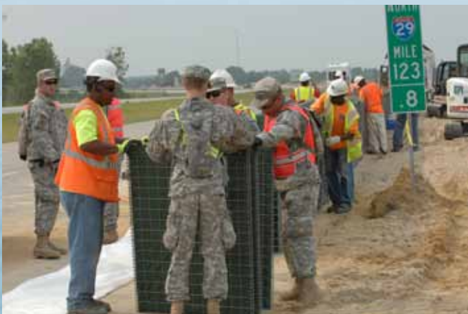
Iowa National Guard troops assisted with installation of flood mitigation along northbound I-29 near Hamburg. The large barrier is filled with sand using an earthmover, eliminating the need for individual sandbags.

Equipment and supplies were packed up and moved to higher ground from the garages at Pacific Junction and Council Bluffs-north, as well as the weigh scales on Interstate 29 in Harrison and Fremont counties. The Onawa rest areas were closed June 22 to serve as a materials storage area for flood mitigation efforts along I-29 near Blencoe and U.S. 30 near Missouri Valley. DOT emergency managers held daily strategy sessions to set the course for a long and drawn out flood event.