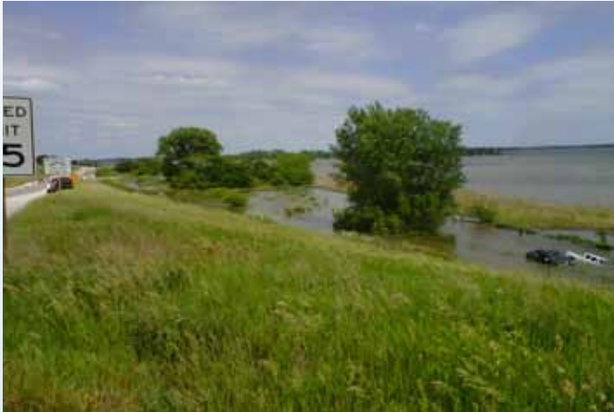
Two vehicles were swept into the flooded right of way.