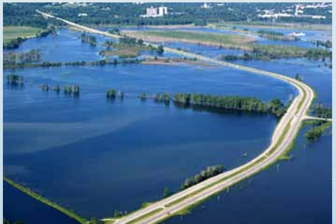
This photo of the Interstate 29 and Iowa 2 interchange was taken June 15.