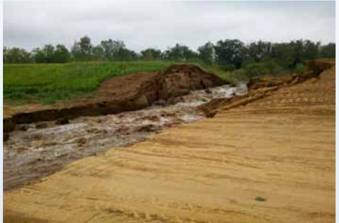
Velocity of the water forces a huge breach in the levee near Hamburg June 13.