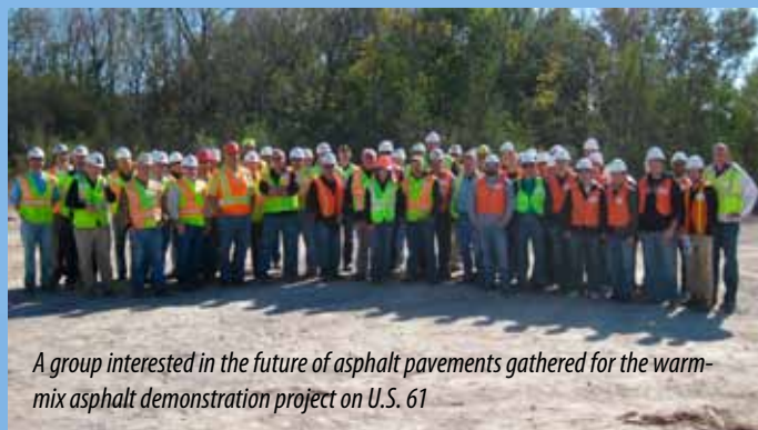
A group interested in the future of asphalt pavements gathered for the warm-mix asphalt demonstration project on U.S. 61

Following an overview of the technologies, the group toured the Manatt's plant site and were able to see and touch the recycled-shingle product, ground to the consistency of black sand. The tour continued to Wendling's quality control lab and finally to the project itself. Manatt's was placing new asphalt shoulders along existing U.S. 61. The construction train included a milling operation removing the existing rock shoulders, placement of a 4-inch asphalt base course and a final 2-inch surface course, with production averaging three miles per day.