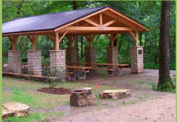
Newly constructed shelter located along trail