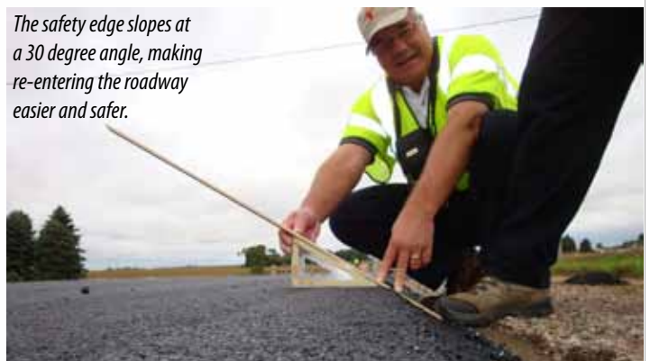
The safety edge slopes at a 30 degree angle, making re-entering the roadway easier and safer.

In terms of roadway edge durability, the gentle slope reduces the edge breakage. The oldest project in the country is now seven years old. "And even if the sloped edges eventually do break off, which we haven't seen yet, we would be no worse off than what we see today with traditional construction," said Roche.