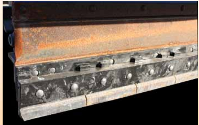
Commercially produced flexible snowplow blade

While last year's testing data showed the JOMA blade to be the most cost-effective, both the DOT-built prototype and another commercial blade showed promise as an alternative to the regular carbide. Dowd said, "The cost of the other commercial product was prohibitive and the DOT-built flexible edge blade needed further development to become a viable option. When we discussed the cost of the other commercial blades with the manufacturer, they were willing to take our suggestions and redesign the mounting system they were using," said Dowd. "We discussed a similar mounting system we used to mount the prototype blades the Iowa DOT's repair shop had built last year that could possibly reduce the cost. In essence, the manufacturer merged the features from the more expensive commercial blade with the DOT prototype's mounting system. We know from the testing last year that these blades are effective, so this year the emphasis of data collections in each district will determine the cost-to-benefit ratio."