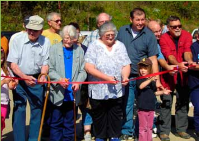
Local volunteers cut the ribbon on the improvements in August

Bowman said, "There were challenges with making sustainable improvements to accommodate large volumes of users in such a small area; and, because the type of improvements involved in developing water trails is still relatively new, there were new challenges for all of the parties involved. Everyone did a great job."