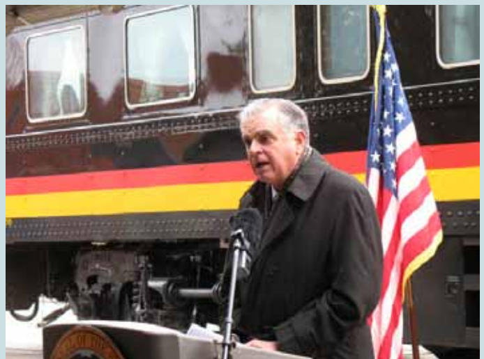
U.S. Secretary of Transportation Ray LaHood came to Iowa to present grant award