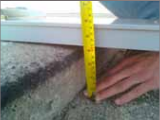
Steep, vertical edges can cause problems for drivers