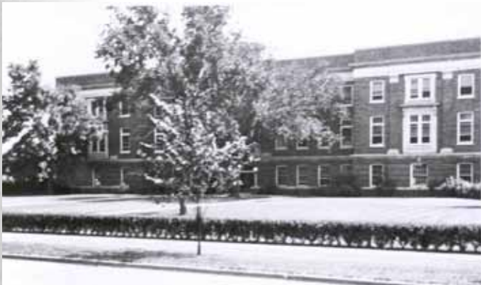
Iowa Highway Commission Building in Ames completed in 1924

The building was authorized by the fortieth general assembly, April 18, 1923, to be constructed at a cost of approximately $125,000. The site was donated thru the generosity of Ames citizens.