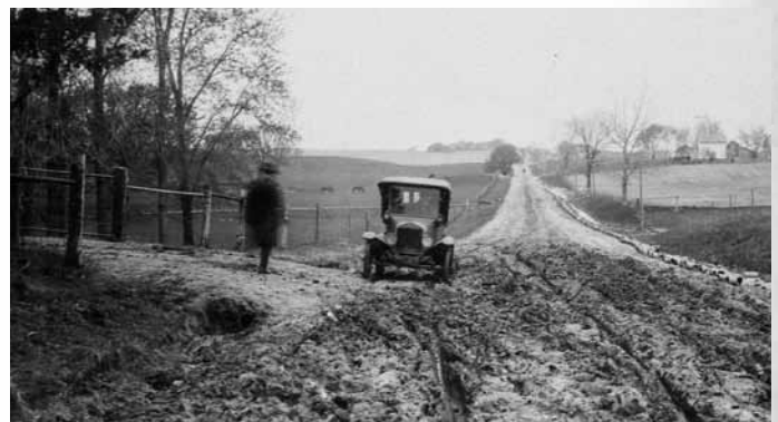
Driver experiencing some difficulties before paved roads, circa 1920s

Officials stated today that two transformers had been installed in lieu of the one that failed last night, so that future events at the commission building would not be threatened with the "embarrassment" experienced last night.