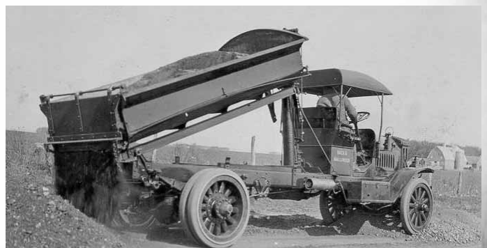
Early 1920s dump truck

Beth Collins at 515-239-1702 or beth.collins@dot.iowa.gov .