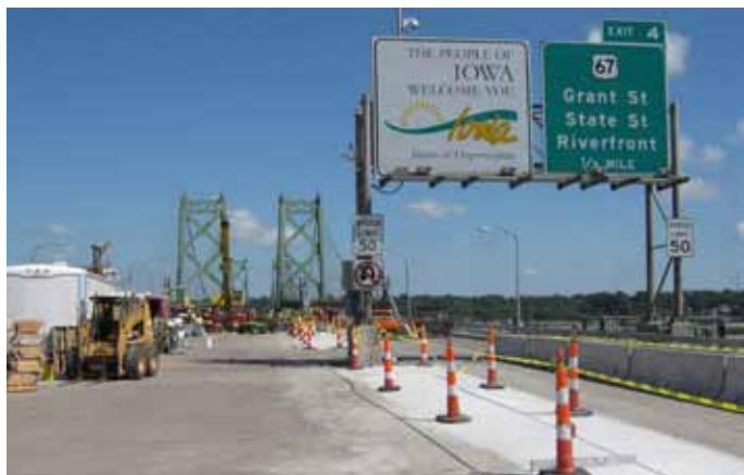
The Interstate 74 bridges over the Mississippi River are under rehabilitation this year. On the Iowa-bound bridge, as shown here, the right lane was closed for 38 calendar days and left lane closed for 33 days. Considering the high traffic volume on this bridge, the contractor received an incentive of $1,950,000 for opening the bridge to two lanes of traffic before the maximum allowed 110 calendar days.