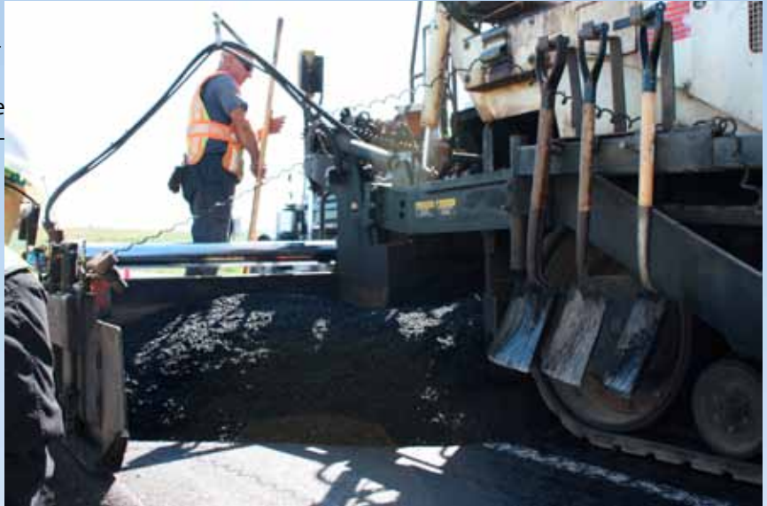
A Norris Asphalt employee works on the warm-mix pavement on U.S. 34 near Creston.

On Sept. 7, more than 30 attendees witnessed the benefits of WMA first hand. The asphalt was produced at approximately 260 degrees Fahrenheit, a drop of roughly 50 degrees below hot-mix asphalt production temperatures and compacted behind the paver at 245 degrees Fahrenheit.