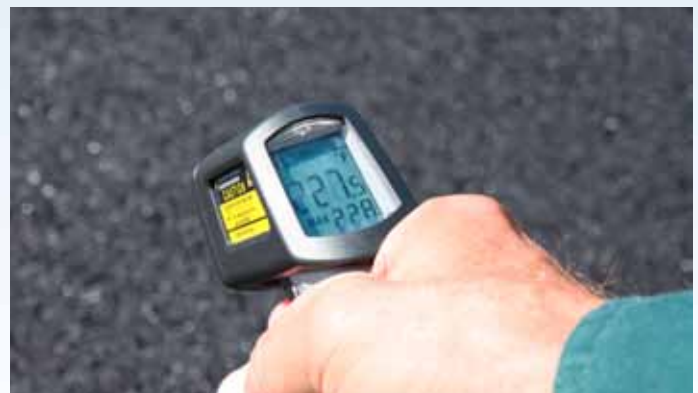
Warm-mix asphalt temperatures can be 50 to 100 degrees Fahrenheit less than hot-mix asphalt.

Previous studies of WMA have found that WMA takes less compaction effort to achieve density of the new pavement. "We are looking at the use of WMA as a win-win situation for both the Iowa DOT and contractors," continued Schram. "Equivalent or better quality material is being provided by contractors, with the added benefits of a friendlier work environment and reduction of greenhouse gases. We are able to rely on WMA during cold weather operations, as well as provide an added value at a reduced cost to taxpayers."