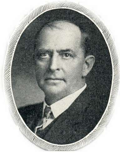
Senator Anthony McColl

BE IT ENACTED BY THE GENERAL ASSEMBLY of THE STATE OF IOWA: