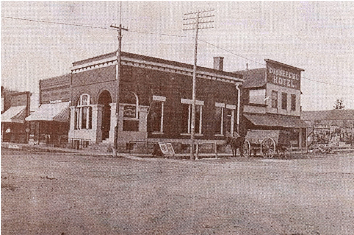
Hopkinton, Iowa, birthplace of Frank Merriam

Frank Merriam became California Governor at age 68 and was the oldest person to become governor until Jerry Brown, at age 72, was elected in 2010.