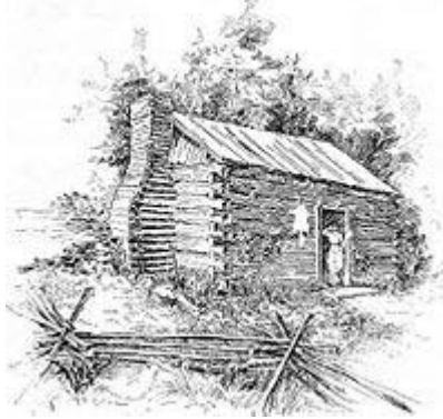
Double log cabin, $50 to $70.

Scythe, axe, pitchfork, spade and rake, $3.50.