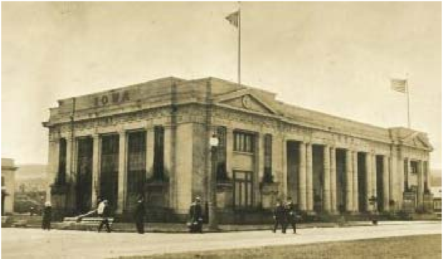
Iowa Building at the Panama-Pacific International Exposition