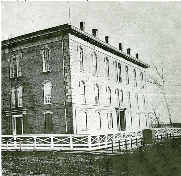
"Old Brick Capitol," Des Moines, Iowa

BACKGROUND: The Fourteenth General Assembly convened on January 8, 1872, and adjourned on April 23—a 107-day session. The Fourteenth General Assembly occupied the "Old Brick Capitol" in Des Moines, the site of the Soldiers' and Sailors' monument today. The House of Representatives was comprised of 78 Republicans and 22 Democrats. In the Senate, there were 42 Republicans and eight Democrats. Lieutenant Governor Henry C. Bulis presided over the Senate and the Speaker of the House was James Wilson. Cyrus Clay Carpenter was sworn in as governor on January 11, 1872. He was 42 years old. The 1870 census showed Iowa's population was 1,194,020.