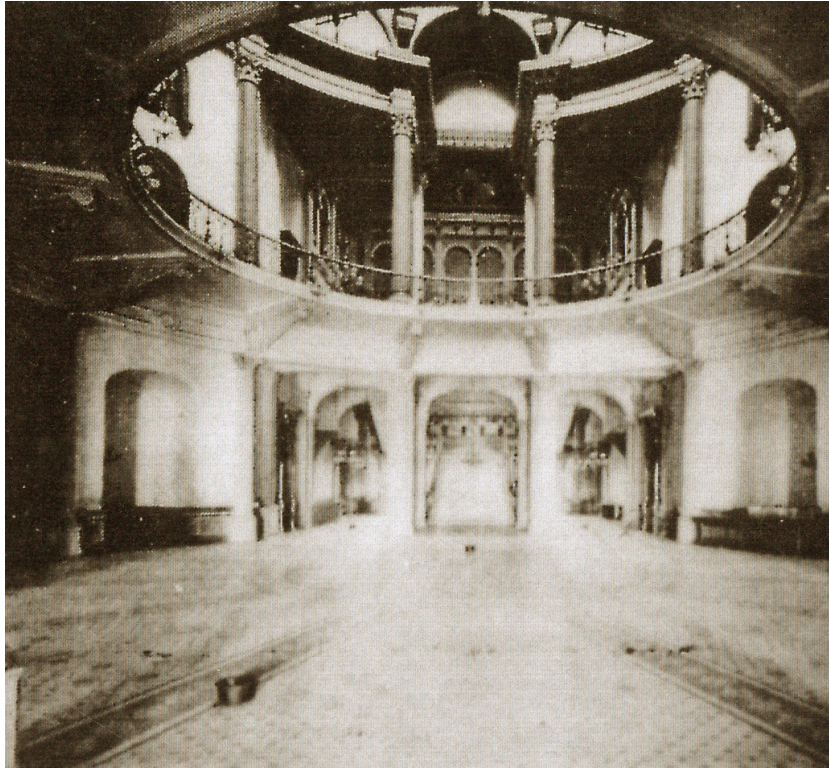
The opening in the first floor rotunda was completed about 1915

November 15, 1907—Contract awarded to the Flower City Ornamental Iron Works for construction of stairway between the first floor and basement in the east wing of the Capitol building, at $1,000.00