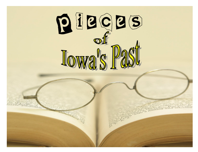
Pieces of Iowa's Past , published by the Iowa State Capitol Tour Guides weekly during the legislative session, features historical facts about Iowa, the Capitol, and the early workings of state government. All historical publications are reproduced here with the actual spelling, punctuation, and grammar retained.