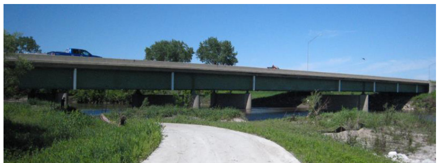
Field tests for this project were conducted on the US 30 Bridge over the South Skunk River in Ames, Iowa

In some cases, the precipitous has been a desire to avoid damage that might go unnoticed until the next biennial inspection. Of specific and immediate concern was the state's inventory of fracture-critical structures.