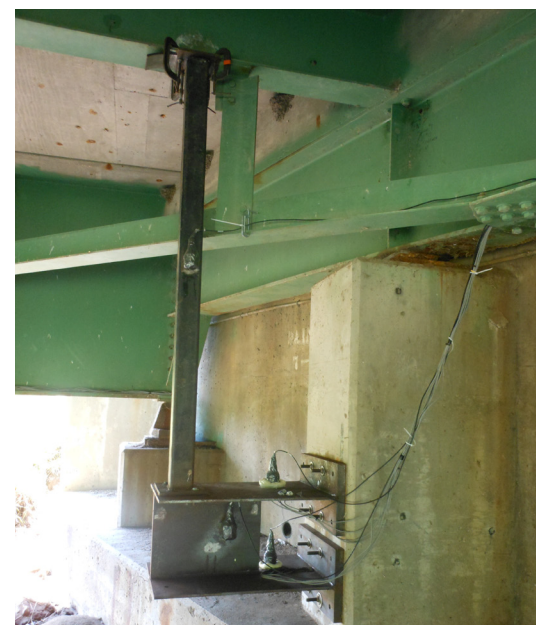
Sacrificial specimen with accelerometers and varying levels of damage induced for vibration-based on-site field tests

The proposed algorithm was based on localizing sensors around failure-critical joints and establishing transmissibility ratios. The methodology was tested in laboratory experiments and field tests.