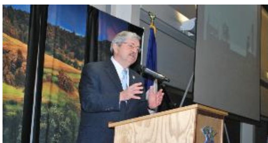
Governor Terry Branstad