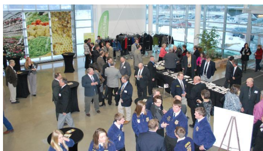
FFA students mingle with Ag Leaders