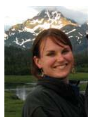
Summer's Gallaudet portfolio photo

Bob: If you met a parent who hopes implants would be the only thing their infant or toddler needs to communicate, would that make sense to you?