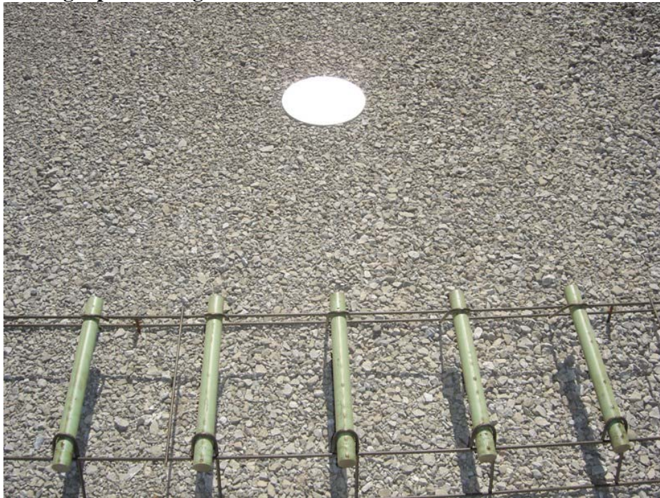
Figure 1 Target placed on granular subbase.

On a subsequent placement, a quick setting construction adhesive was used to glue the targets to the top layer of rock. The subbase material was coarse on the surface and there were high spots that the targets laid on. The targets would bend and deform under the weight of a person. Approximately, one-half of a cubic foot of concrete was then placed over the targets ahead of the spreader. All the targets remained in place using this method.