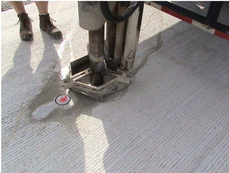
Figure 4 Coring at test locations.

Since PCC pavements are placed on granular sub base in Iowa, the concrete will slump around the larger aggregate particles. These aggregate particles are removed before testing for thickness, but the resulting core thickness is typically greater than it would be on the target or a treated base. Thus, cores were taken at several locations approximately one foot longitudinally from the first core to determine the difference between those measured on the target and typical core measurements on a granular sub base (Figure 6 and 7). Core thickness measurements were made using an Iowa DOT fabricated 9-point measuring frame (Figure 8). The measurements were made to the nearest 0.05 inches. The results of the testing are shown in table 1 and figure 10.