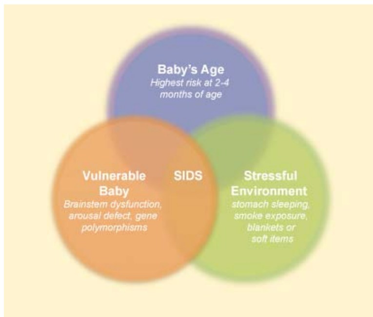
Figure 2: Triple Risk Model for SIDS