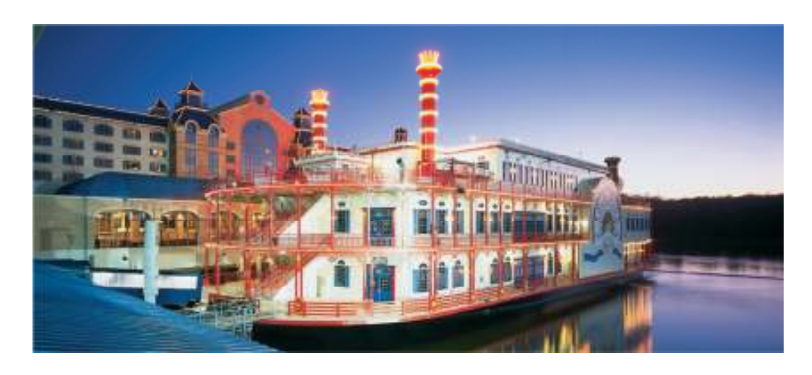
Council Bluffs, IA