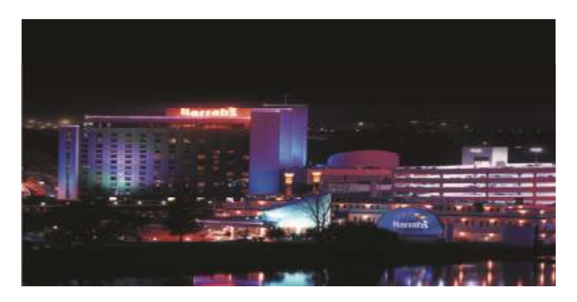
Council Bluffs, IA