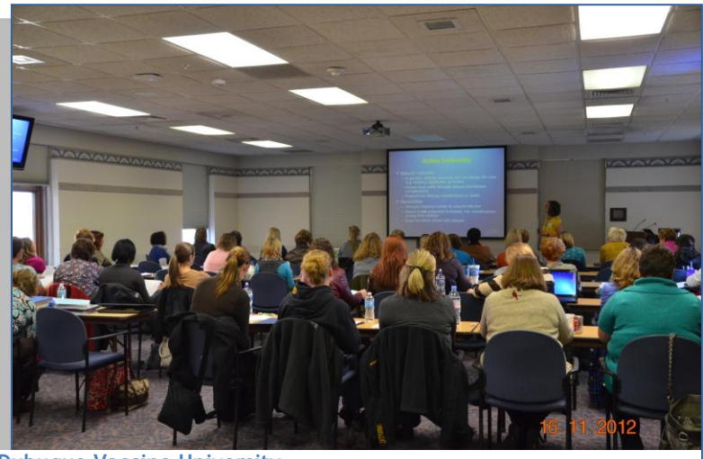
Dubuque Vaccine University

In October and November 2012 the Iowa Immunization Program presented Vaccine University to more than 500 participants at 10 locations across the state. The trainings focused on vaccine education and recommendations for vaccine storage and handling, Vaccines for Children Program guidelines, and Iowa's licensed child care and school immunization requirements. Copies of the training presentations are available on the Immunization Program website. Thank you to everyone who attended Vaccine University.