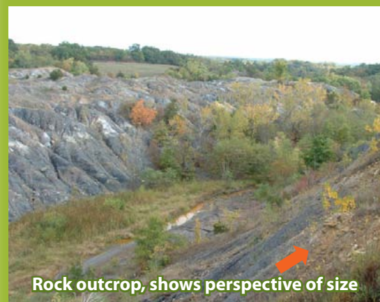
Rock outcrop, shows perspective of size