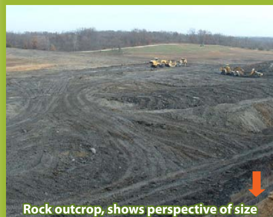
Rock outcrop, shows perspective of size