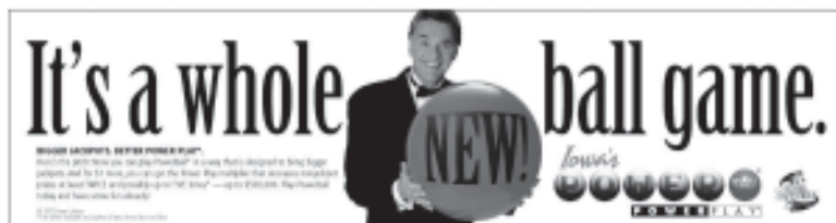
This sign was used to alert players of the changes to the Powerball game in October 2002.

As Powerball's player base has expanded, lotteries in the game have needed to ensure it will continue to offer what customers want: large jackpots. And, these changes mean that in some instances the big winnings will spill down, another frequent customer request. A new "Match 5 Bonus" system now takes effect when the Powerball jackpot reaches a new record level. Once in