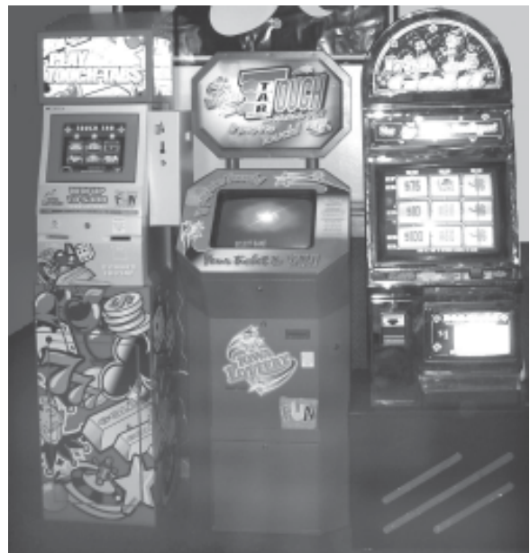
Monitor vending machines were placed in 26 Iowa Lottery age-controlled retail locations for a test beginning in May 2003.

After six months of testing, the lottery will analyze sales data from these 30 machines. We anticipate the machines will enhance the lottery’s ability to generate revenue for the state.