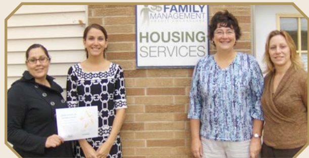
Family Management Credit Counselors