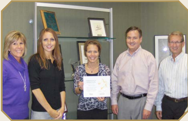
Veridian Credit Union