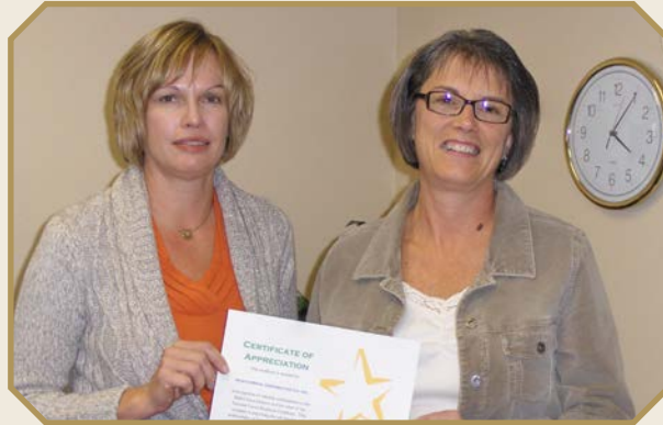
Martin Brothers Distributing Co.