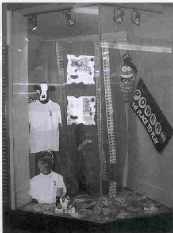
The Dollar Warehouse in Valley West Mall, West Des Moines, recently became a lottery retailer. To celebrate, they decorated their front window with lottery tickets, posters, T-shirts, banners and other lottery "stuff."