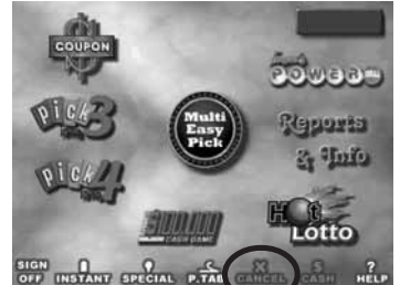
The Extrema's main screen

The $100,000 Cash Game, Pick 3 and Pick 4 games' tickets can be cancelled. However, they must be cancelled the same day, in the same store where they are sold and before the sales cutoff for the game. Follow the procedure below to make sure you get proper credit for the cancelled ticket: